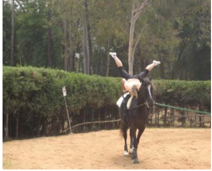
Giving Jac a turn - swing time!