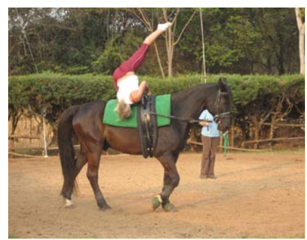
Working with Dekador - new moves and cantering