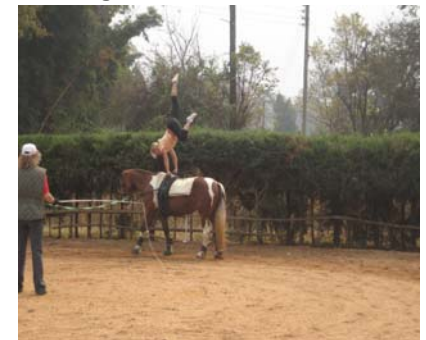
Hand stand time!