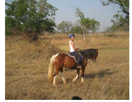
A hack and a Yack on the last day. Dances with kids!!